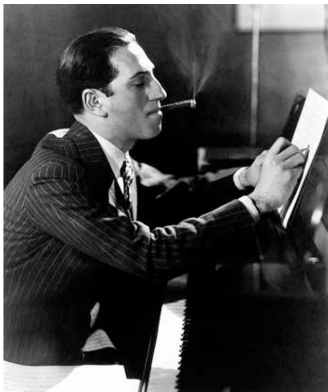
George Gershwin hard at work composing at the piano.

Come and hear the Police Band play some of the all-time favourites by Gershwin and his contemporaries in concert this month at the Joan Sutherland Performing Arts Centre. This